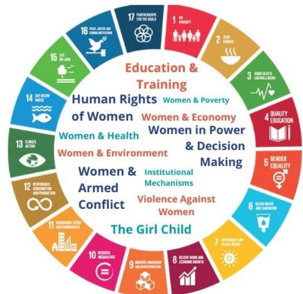
Graphic is from GWI website and includes all 17 SDGs and the programs that GWI supports to address them.

GWI understands that graduate women have the competencies to respond to capacity needs identified by the UN and that Institutes of Higher Learning can share responsibility in this effort.